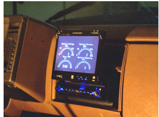
Typical Installation With DVD Player

Information about the battery type, voltage, and capacity are programmed at the factory but can be changed with the field programming kit. This kit has a USB cable which can be used to get a data stream of the data shown on the screen.